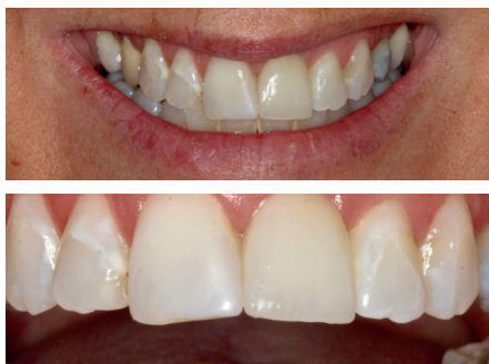
Immediate Implants Inverta anterior tooth: