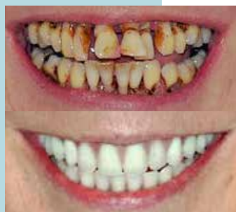
Case Study 3